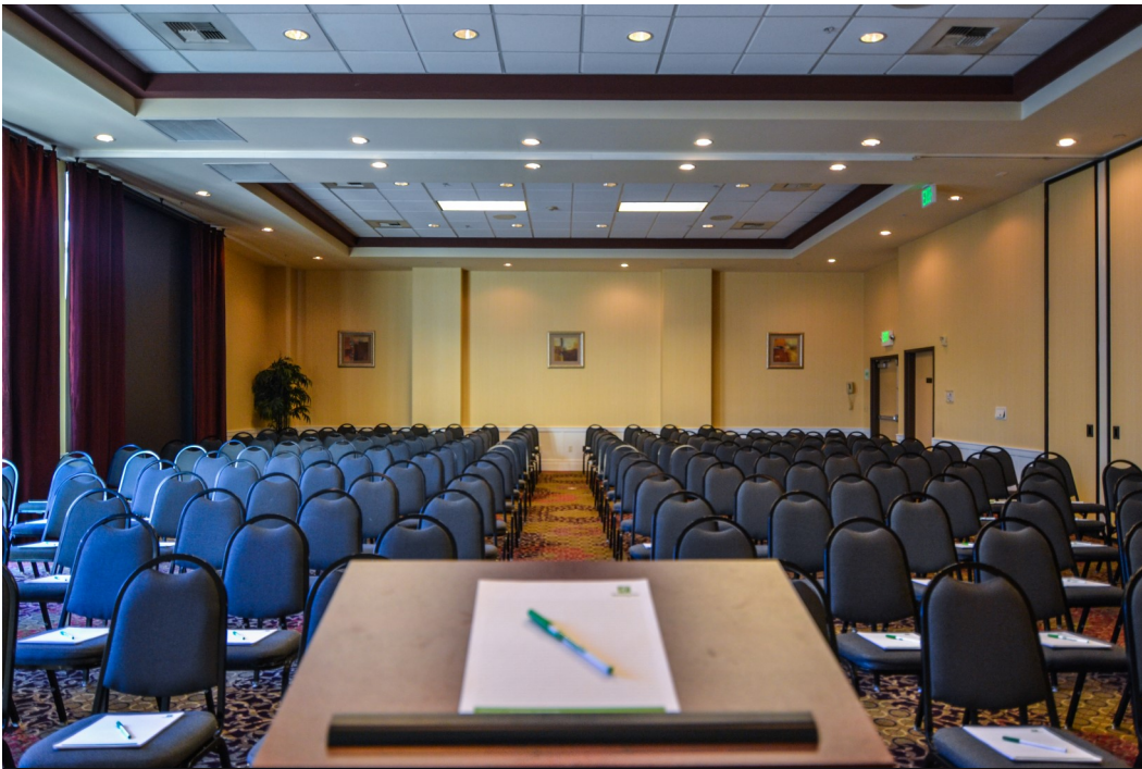
Grand Ballroom – Theatre Style Setup

When booking your event with Holiday Inn Seattle-Downtown, whether you're organizing a corporate meeting, a social event or planning a special occasion for family and friends, there is no other hotel that makes the planning process as simple as we do. With spacious meeting rooms, competitive pricing, state-of-the-art audio-visual, and a new and modern catering menu, you can rely on our passionate staff to take care of your event from start to finish.