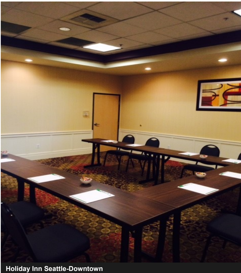
Holiday Inn Seattle-Downtown

Suite 604 offers the perfect solution for business travelers who have the need for a sleeping room, with a separate Boardroom. Our Suite offers a King Bed sleeping room, with a separate closed off Boardroom which offers a separate bathroom, and a kitchenette for your guests. If you aren't looking to spend the night, no problem! Rentals are available on a daily basis if needed.