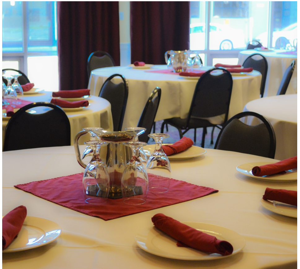
Queen Anne Room – Rounds

Our Cascade Room is 450 Sq. Ft. and a great alternative for intimate events, board meetings, or a smaller break-out room.