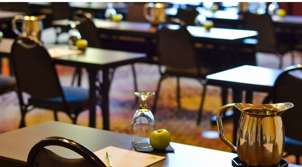
Emerald Room – Classroom Style Setup