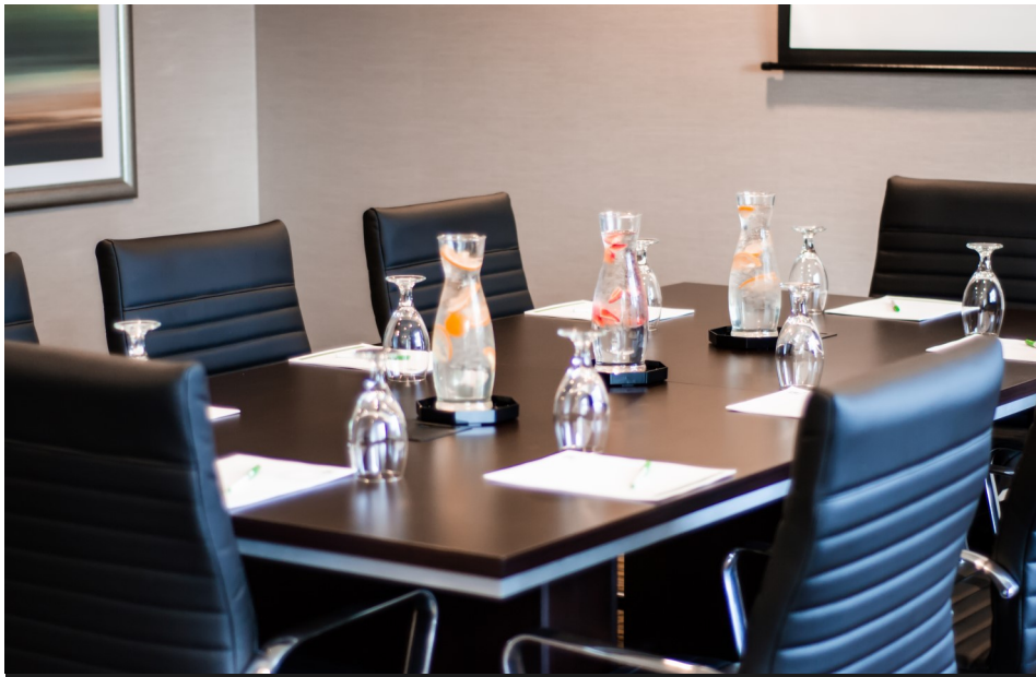
Suite 604 – Sleeping Room with separate boardroom space