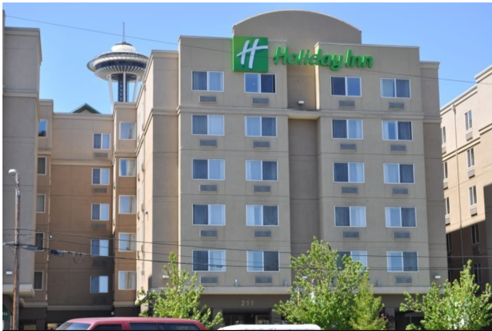
Holiday Inn Seattle-Downtown Exterior