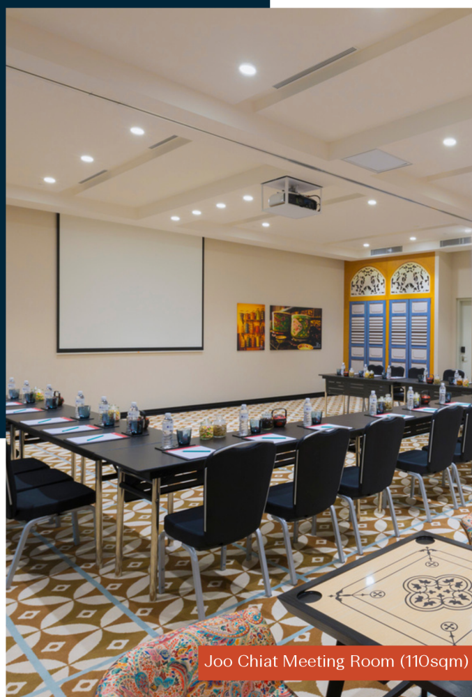
Joo Chiat Meeting Room (110sqm)