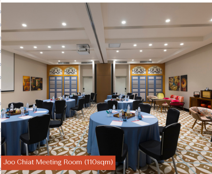
Joo Chiat Meeting Room (110sqm)