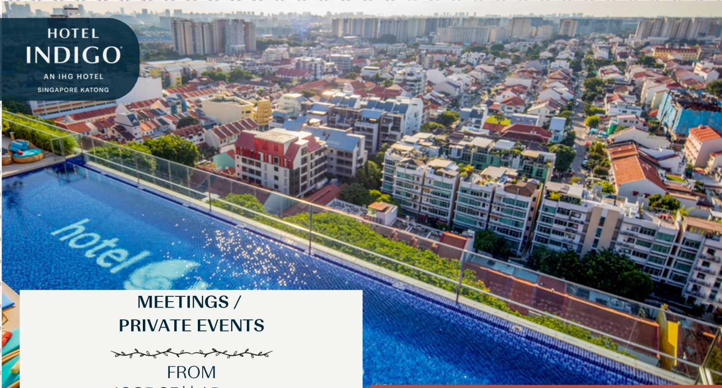
Rooftop 88 - Rooftop Infinity Pool with Dining Space ( Level 16)